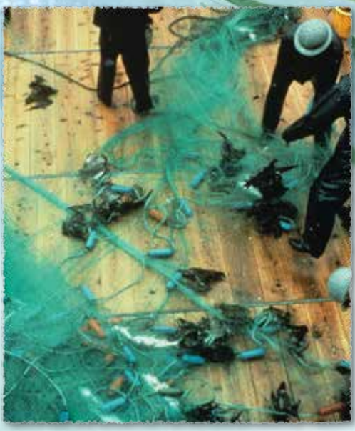
Seabirds are often caught in fishing nets.

Nocturnal seabirds use light from the moon and stars to navigate, find food, tend their nests, and avoid predators. Artificial lights from boats or land can attract and disorient these birds sometimes resulting in injury or death.