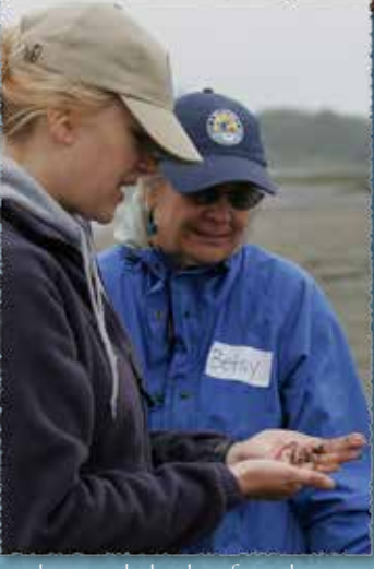
Volunteers help identify and guantify marine wildlife.