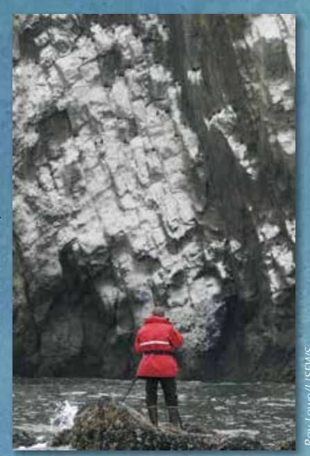
Biologist surveys for Pelagic Cormorants.

Expected rises in ocean temperature due to global climate change may be similar in effect to El Niño events. However. unlike El Niño which is a shortterm natural phenomena that disrupts marine food webs periodically, global climate change represents a more pervasive and permanent change in the ecosystem, the consequences of which are unknown. In fact, climate