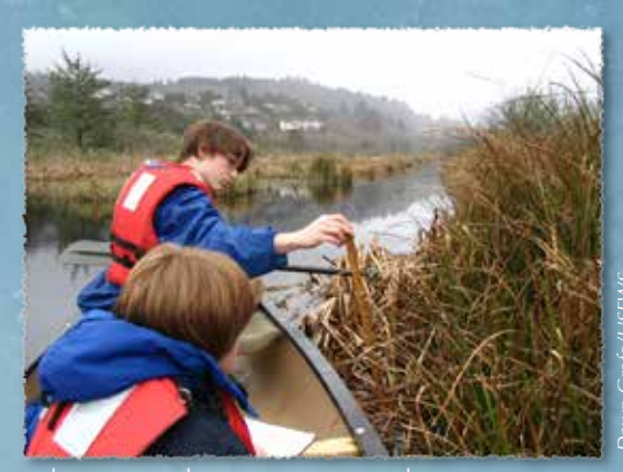
Volunteers conduct surveys in coastal estuaries.

As the human population continues to grow, and the use of marine resources increases, the need to conserve and protect seabirds and their habitats will become more challenging. Efforts to protect marine wildlife by the USFWS and others will continue and through these collaborative efforts millions of breeding and migrating seabirds will be enjoyed by future generations of Americans.